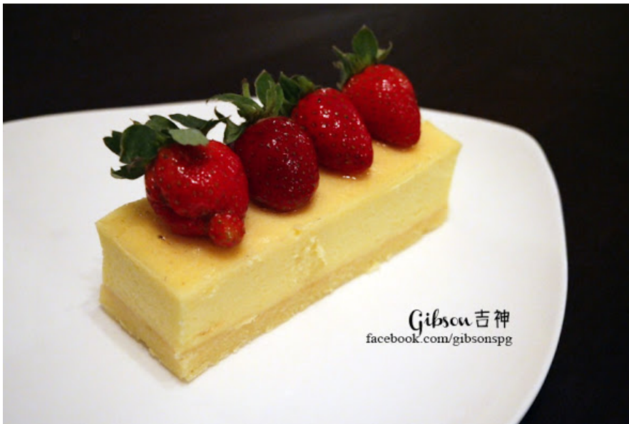
Baked Cheese Cake

The combination of both coconut and passion fruit in a tart, brings out the natural sweetness of both the fruits, while having a unique coconut texture.