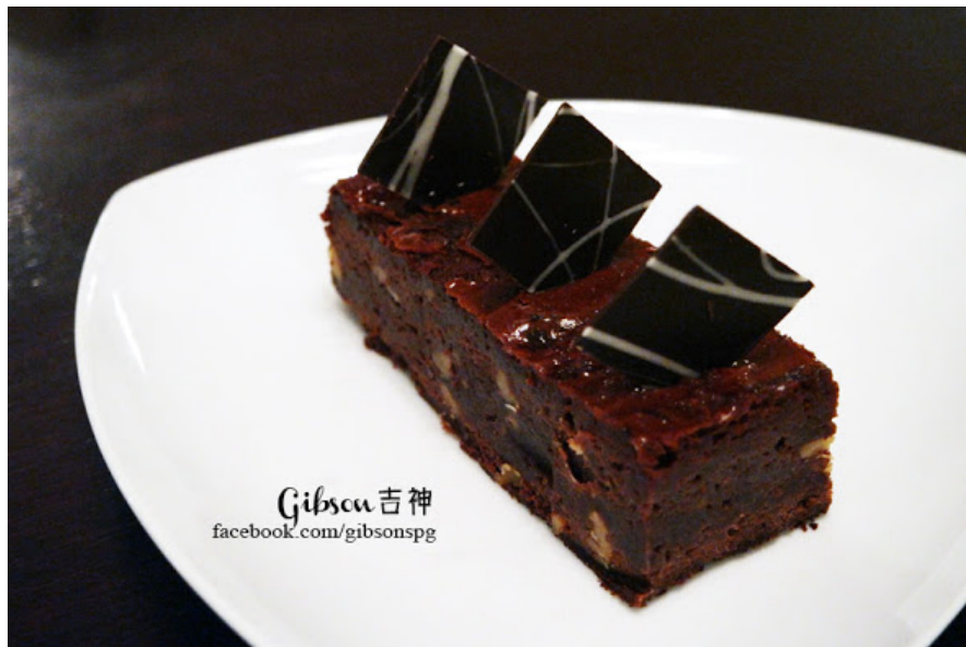
Chewy Chocolate Brownie