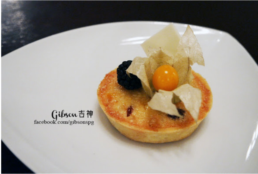
Passion Fruit Tart

The tart crust is flaky and sweet, when taking a bite you will get a delicate balance of taste of everything. This is absolutely Gibson's favorite.