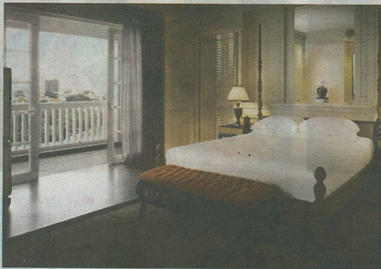
The corner suite bedroom is simple yet elegantly furnished.