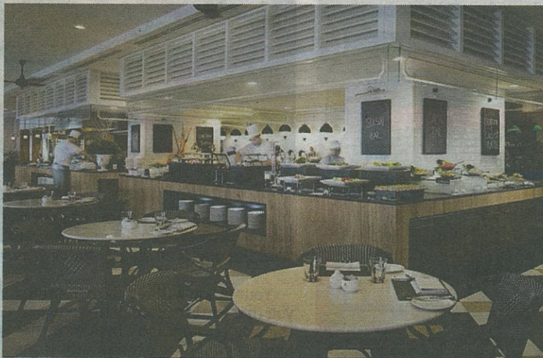
Sarkies, the latest F&B outlet at the Victory Annexe, serves a sumptuous roast duck.