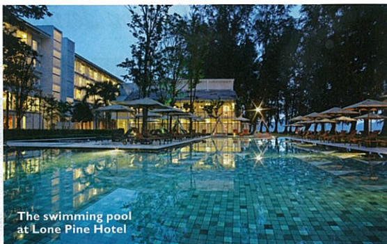
The swimming pool at Lone Pine Hotel