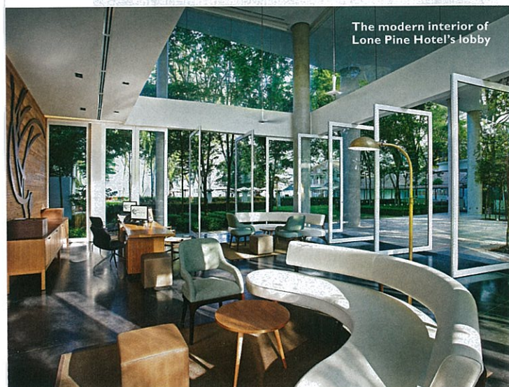
The modern interior of Lone Pine Hotel's lobby