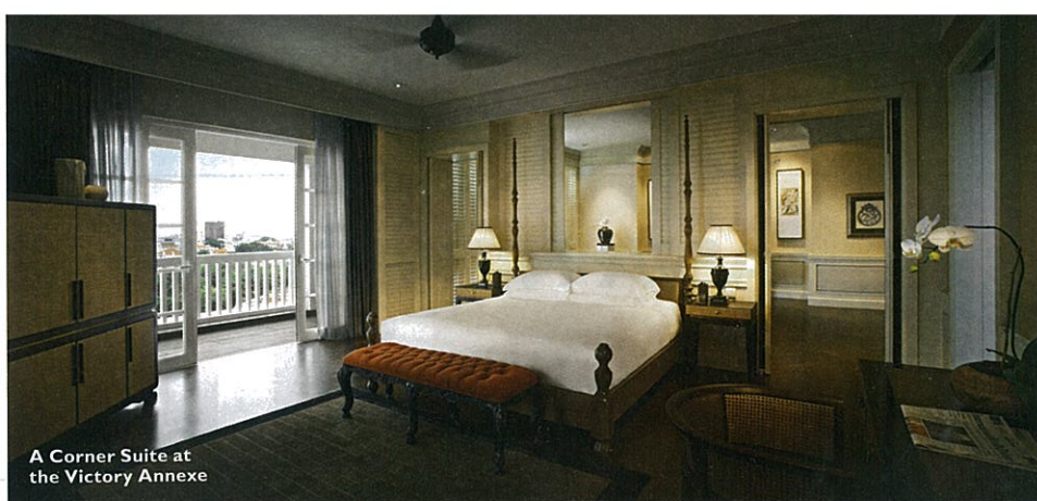
A Corner Suite at the Victory Annexe

culinary delights Penang has to offer – and there's no better place to start than these two sides of paradise. ■ Eastern & Oriental Hotel, 10 Lebuhr Farquhar, Penang. Tel: 04-222 2000. www.eohotels.com . Lone Pine Hotel, 97, Batu Ferringhi, Penang. Tel: 04-886 8686. www.lonepinehotel.com