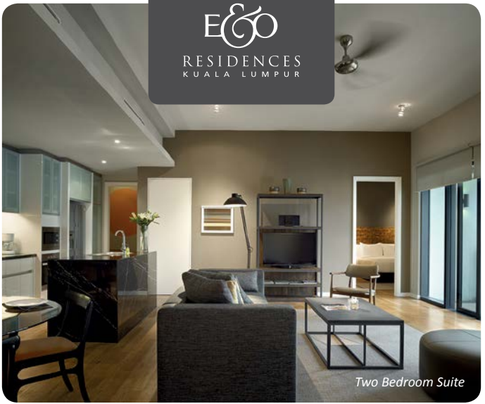
Two Bedroom Suite